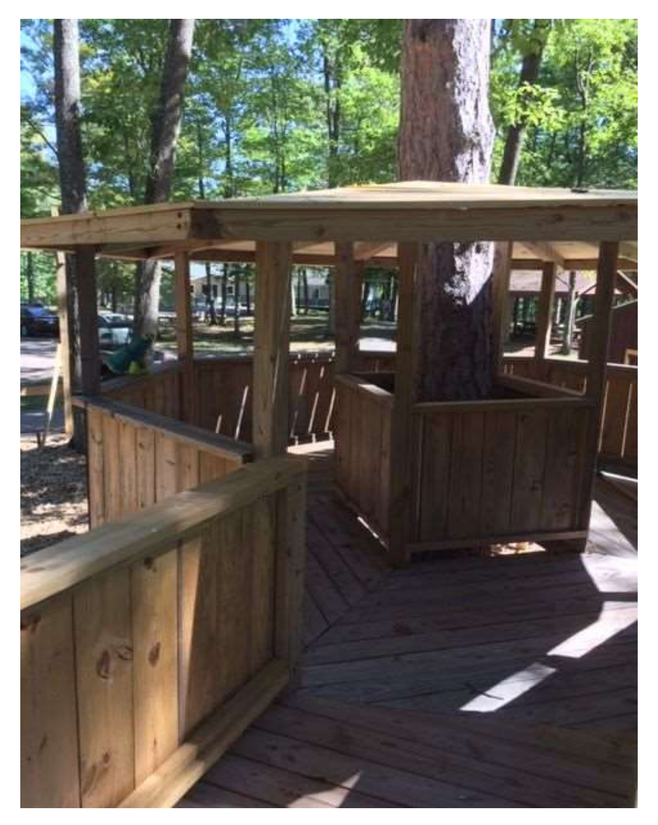
Climb up and view the surroundings of the treehouse/lookout structure.