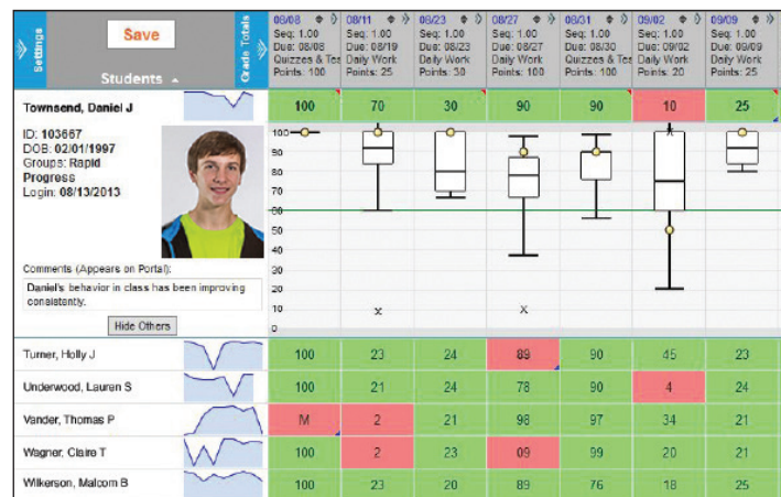
Visual Cues for Student Progress