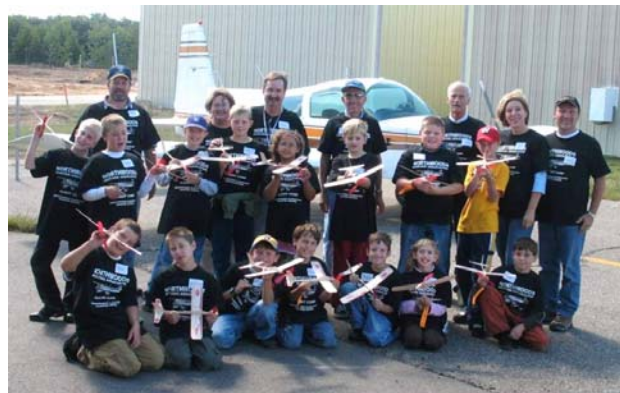
Project on Flight that included traditional and virtual students, as well as community volunteers. The project included learning about flight, building gliders, and a trip to the airport.