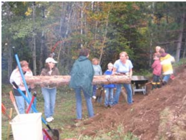
Family Night Students, their families, and staff work together to create terraced seating by the campfire pit.